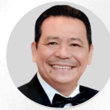
Prof. Otto Hasibuan* Deputy Coordinating Minister for Law, Human Rights, Immigration, and Corrections